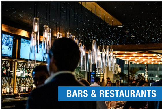
BARS & RESTAURANTS

These affordable panels are perfect for reshaping first impression environments, improving the experience for employees, clients and guests.