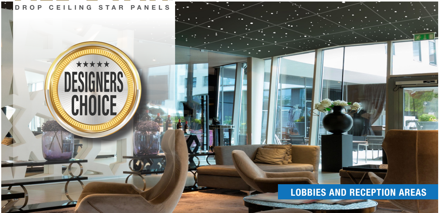
LOBBIES AND RECEPTION AREAS